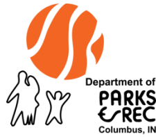
PHOTO DAY PROCESS